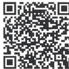
Washington Park School

WE LOOK FORWARD TO SEEING YOU AT THIS YEAR'S BOOK FAIR! THANK YOU FOR YOUR CONTINUED SUPPORT!